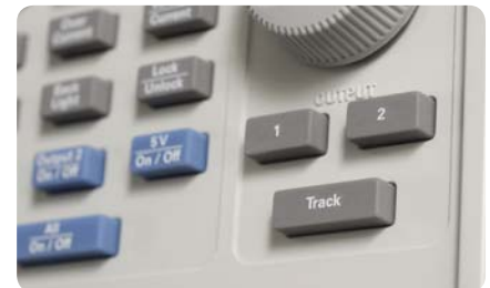
Figure 3. Simplifies Output 1 and Output 2 setup with tracking feature