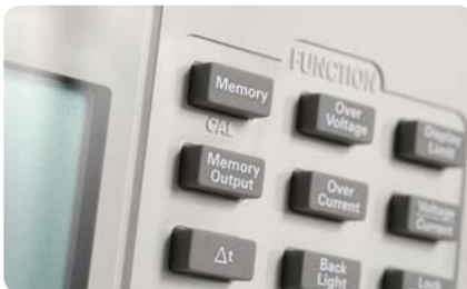
Figure 1. Output sequencing made easy with intuitive keypads

Both models of the U8030 series come with a set of features to suit your needs while remaining easy to use. The LCD screen displays both voltage and current readings in a one-view panel while the all ON/OFF button allows multiple outputs to be controlled simultaneously. Additionally, the auto-track feature simplifies setup between output 1 and output 2. With these, you get a solid bench power supply plus a set of convenient and easy to use features.