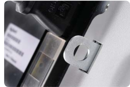
Physical lock mechanism as illustrated

Essential security features: Over-voltage protection (OVP)/ Over-current protection (OCP), keypad lock and physical lock mechanism