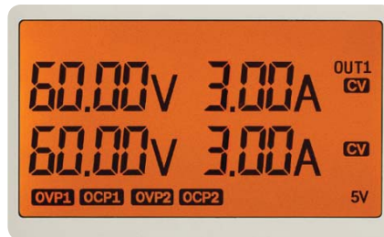
Figure 2. Backlight on/off feature with dual reading (voltage and current) on an LCD display