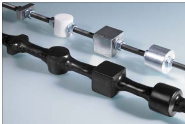
Due to the high shrink ratio HA67 is suitable for complex shapes and dimensions.