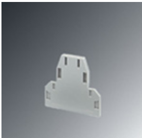
Spacer plate, to compensate for level offsets, Length: 56 mm, Width: 2.5 mm, Height: 62 mm, Color: gray

Please be informed that the data shown in this PDF Document is generated from our Online Catalog. Please find the complete data in the user's documentation. Our General Terms of Use for Downloads are valid ( http://phoenixcontact.com/download )