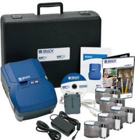
* BMP53 kit shown.