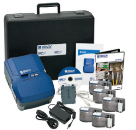
* BMP53 kit shown.