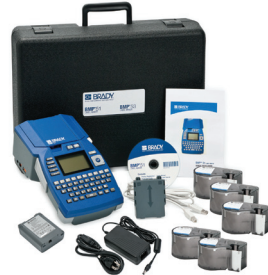
* BMP51 kit shown.