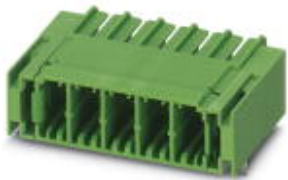
The figure shows a 3-position version

Header, Nominal current: 41 A, Rated voltage (III/2): 630 V, Number of positions: 5, Pitch: 7.62 mm, Color: green, Contact surface: Tin, Mounting: Wave soldering