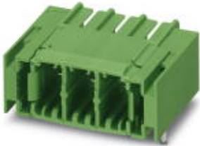
The figure shows a 3-position version

Header, Nominal current: 41 A, Rated voltage (III/2): 630 V, Number of positions: 5, Pitch: 7.62 mm, Color: green, Contact surface: Tin, Mounting: Wave soldering