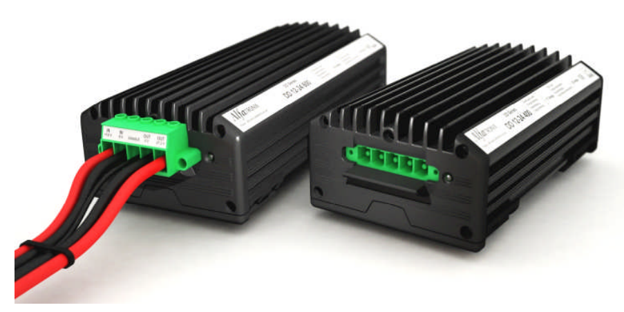
The new 400W and 600W 12V-24V units shown here with the new Phoenix connector. Supply INCLUDES the mating half and further eases installation while providing a secure connection reinforced with additional pull resistance.

The latest addition to the range includes two high current (17 and 25Amps output) units. These use state of the art designs with efficiency up to 93% and practically all components mounted using computer controlled surface mount technology (SMT). The result is a robust product with low component mass. The mechanical aspects include a brand new casing profile designed for maximum heat dissipation as well as a new design of our highly successful mounting cradle that allows the unit to be fully wired before 'clicked' into place. This provides for a faster installation time with mechanics capable of withstanding long term vibration with no risk of screws falling out.