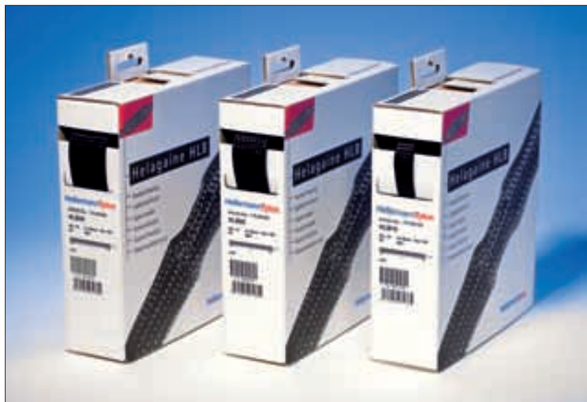
Helagaine HLB: The expansion rate makes it possible. Only three sizes in a handy dispenser box for almost all standard diameters.

To prevent fraying, the sleeve is cut with a hot-cutting tool, which melts and cleanly fuses the ends of the yarn