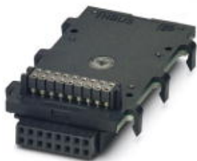
Plug component, Nominal current: 3 A, Number of positions: 16, Pitch: 2.54 mm, Color: jet black

Please be informed that the data shown in this PDF Document is generated from our Online Catalog. Please find the complete data in the user's documentation. Our General Terms of Use for Downloads are valid ( http://phoenixcontact.com/download )