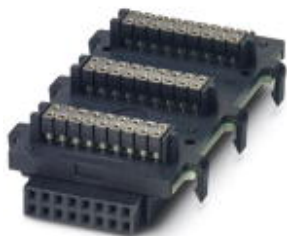
Plug component, Nominal current: 3 A, Number of positions: 16, Pitch: 2.54 mm, Color: jet black

Please be informed that the data shown in this PDF Document is generated from our Online Catalog. Please find the complete data in the user's documentation. Our General Terms of Use for Downloads are valid ( http://phoenixcontact.com/download )