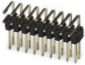
Pin strip (horizontal)