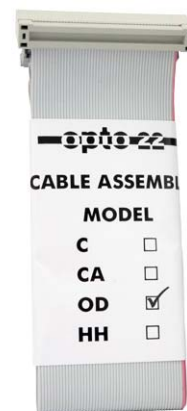
Cable with edge and header connectors