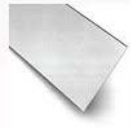
3M™ Round Conductor Flat Cable, 3365 Series, 3365/40, 100 ft.