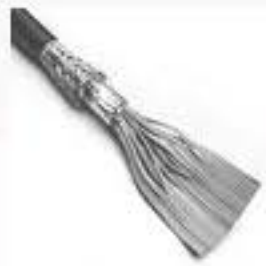
3M™ Round, Shielded/Jacketed, Flat Cable, 3659 Series 3659/26, 100 ft.