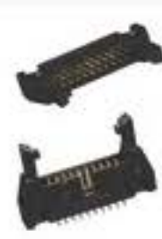
3M™ 4-Wall Header .100 in., High Temp Option, Right Angle, 50 Contacts, 3433-5002