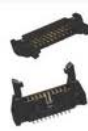
3M™ 4-Wall Header .100 in., High Temp Option, Straight, 16 Contacts, 3408-6002