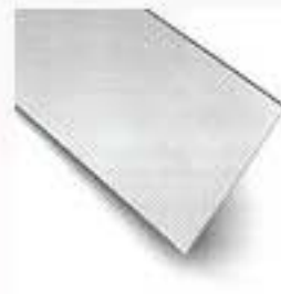
3M™ Round Conductor Flat Cable, 3365 Series, 3365/16, 100 ft.