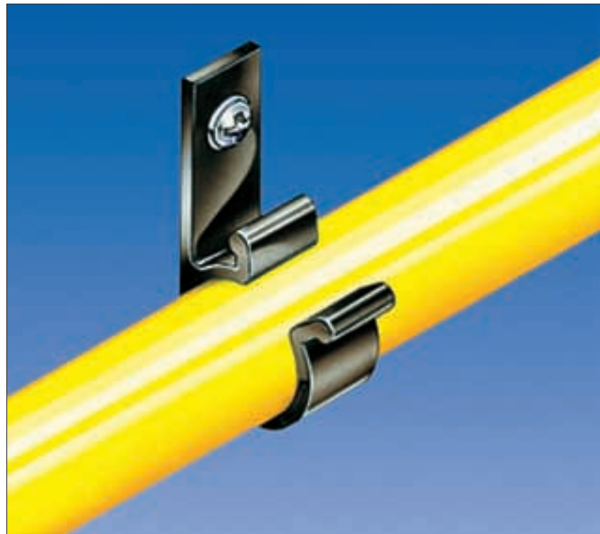
The clip is held in place by a screw and the bundled cable or pipe is guided securely.

Screwed D-clips are available in 3 sizes and guarantee time and cost saving by simply pressing the cable into the holder. The flexible grip means that later removal or replacement of cables and pipes is possible. 3 different bore diameters for fixing the holder are available