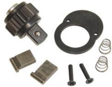
4603 repair kit