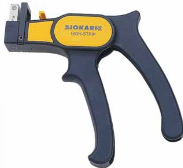
20450 Auto stripper High strip

For conductors with large cross sections. Also suitable for stripping sheathing from 3 x 0.75mm Ø PVC flex. No adjustment necessary.