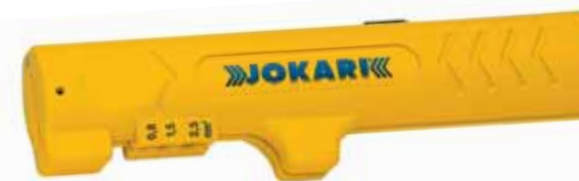
30140 Cable stripper Twin & earth flat

For round cable. Can be used on cable from 8mm to 13mm without the need for adjustment.