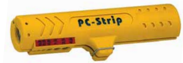
30160 Data Comm stripper PC

For fireproof cable. Retractable safety trimming knife blade and pocket clip. For standard and solid conductors. With additional precision conductor stripping blades.