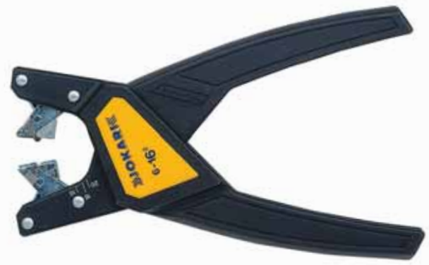
20090 Auto stripper