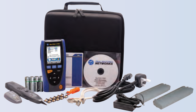
NavITEK II PRO - Premium kit