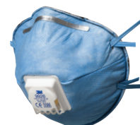
9926 P2 respirator