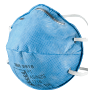
9915 P1 respirator