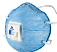
9916 P1 respirator