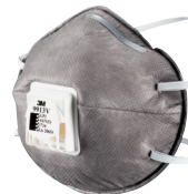
9913V GP1 respirator