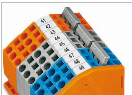
4-conductor through terminal blocks, angled type Formation of groups with 3-way, comb-style jumper bars