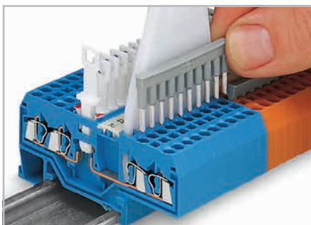
Disconnect terminal blocks for test and measurement 10-way, comb-style jumper bar