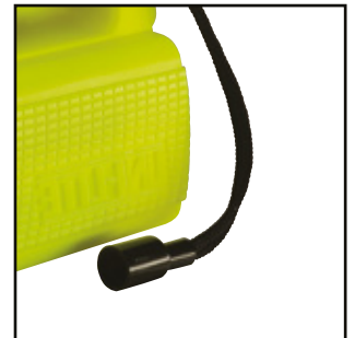
> Nylon Carry Strap