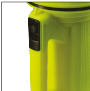
> Moulded Rubber Switch