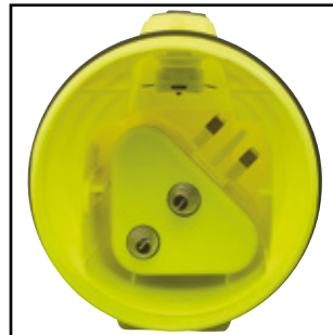
> Easy Fit Battery Replacement