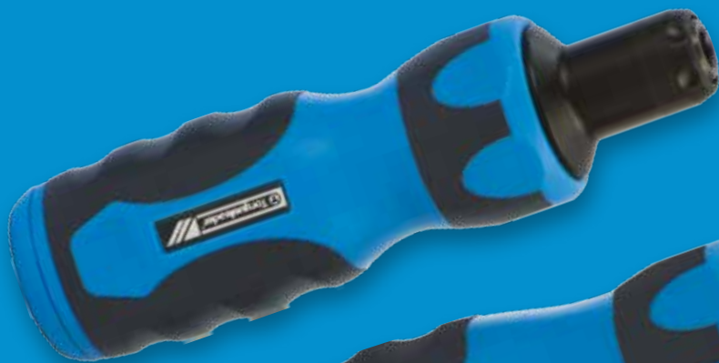
Pro 25 & 150

For Bits & Blades... see pages 64-66 or visit www.torqueleader.com