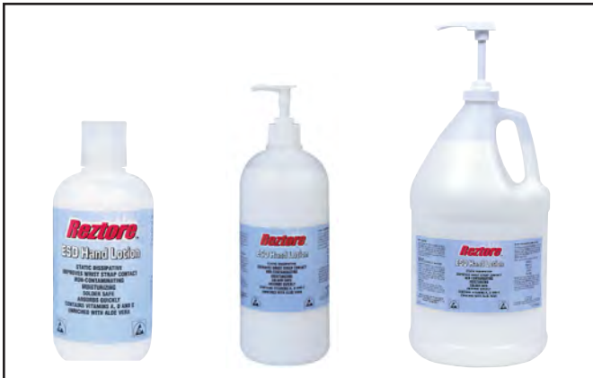
Figure 1. Reztore™ ESD Hand Lotion.