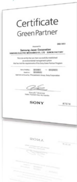
Sony Green Partner