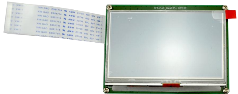
4.3" Touchscreen LCD Module with 50-pin FPC Cable