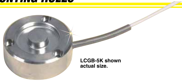
LCGB-5K shown actual size.

The LCGB Series comprises miniature low-profile compression load cells with excellent long-term stability. An all stainless steel construction ensures reliability in harsh industrial environments. These cells are designed to be mounted on a flat surface using cap screws to secure them to the base. A load button is integral to their basic construction for even force distribution.