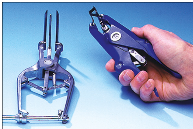
Fast, secure application with the three-pronged expansion tools.