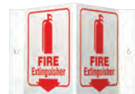
V1FEG1G 6" x 9" x 4" PL