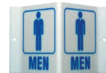
V1ME02A 6" x 9" x 4" PL