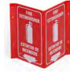
V3FE15A 11" x 12" x 5" PL