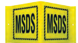
V2MS24A 8" x 15" x 6" PL