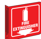
LOFE15A 8" x 8" PL