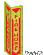
50784 18" x 7-1/2" BGPL