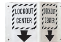
45375 8" x 14-1/2" x 6" PL