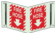
94029 12" x 9" BGPL