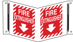
96908 12" x 18" PL