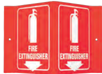
V1FE15A 6" x 8" x 4" PL