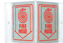
V1FHG1G 6" x 9" x 4" PL