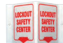
V1LS01A 6" x 9" x 4" PL