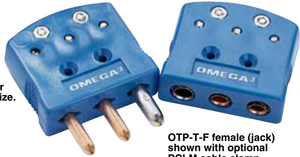
OTP-T-F female (jack) shown with optional PCLM cable clamp.

Both shown slightly larger than actual size.