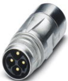
Coupler connector, straight, SPEEDCON locking, M17, Number of positions: 5+PE, Type of contact: Male connector, Crimp connection, shielded: Yes, Cable diameter: 9 mm...11 mm

Please be informed that the data shown in this PDF Document is generated from our Online Catalog. Please find the complete data in the user's documentation. Our General Terms of Use for Downloads are valid ( http://phoenixcontact.com/download )