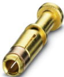
Crimp contact, turned, Single contact, Contact diameter: 2 mm, Crimp range: 1 mm 2 ...2.5 mm 2

Please be informed that the data shown in this PDF Document is generated from our Online Catalog. Please find the complete data in the user's documentation. Our General Terms of Use for Downloads are valid ( http://phoenixcontact.com/download )