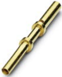
Crimp contact, turned, Contact diameter: 0.6 mm, Crimp range: 0.34 mm 2 ...0.5 mm 2

Please be informed that the data shown in this PDF Document is generated from our Online Catalog. Please find the complete data in the user's documentation. Our General Terms of Use for Downloads are valid ( http://phoenixcontact.com/download )