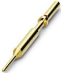
Crimp contact, turned, Contact diameter: 0.6 mm, Crimp range: 0.14 mm 2 ...0.34 mm 2

Please be informed that the data shown in this PDF Document is generated from our Online Catalog. Please find the complete data in the user's documentation. Our General Terms of Use for Downloads are valid ( http://phoenixcontact.com/download )