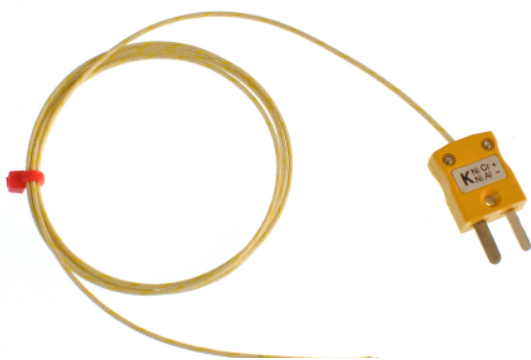
Types K with 're-wireable' miniature flat pin plug

Technical support is always freely available from our experienced technical sales teams and the company has ISO9001 accreditation.