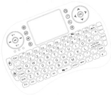
Mini wireless keyboard and touchpad