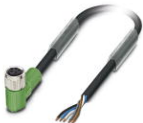
Sensor/Actuator cable, 5-position, PUR, black-gray RAL 7021, free cable end, on Socket angled M8, B-coded, Cable length: 5 m

Please be informed that the data shown in this PDF Document is generated from our Online Catalog. Please find the complete data in the user's documentation. Our General Terms of Use for Downloads are valid ( http://phoenixcontact.com/download )