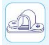
Spacer Bar Saddle