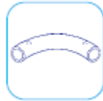
Normal Bend L.G.