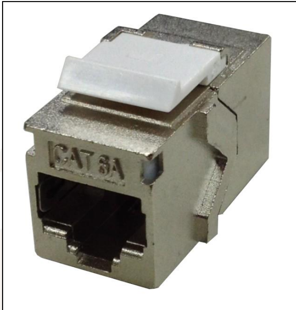
Category 6A Shielded Keystone Panel Mount Coupler (SGACKS2)