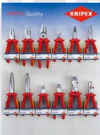
00 19 00 LE