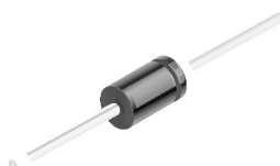
DO-41 Glass case COLOR BAND DENOTES CATHODE