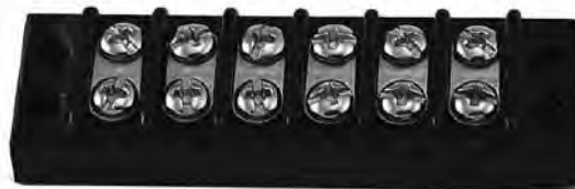
410 GP 06 PSB