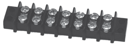
600 GP 07 PSB

300 Volts AC/DC (Class B) 150 Volts AC/DC (Class C)