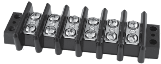
603 GP 06