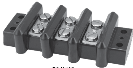
605 GP 03