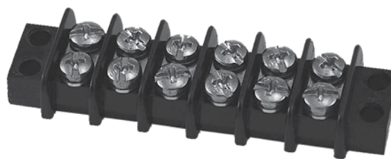
600A GP 06