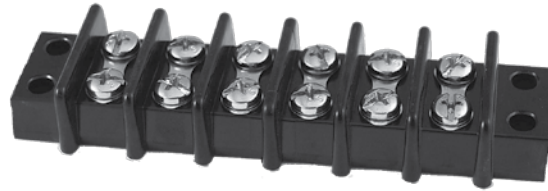
602 GP 06