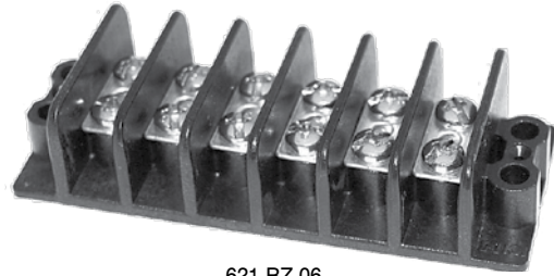
621 RZ 06