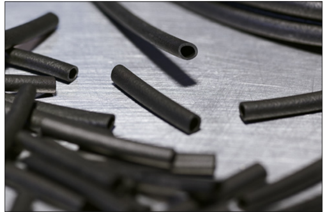
H rubber tubing is highly flexible and easy to apply.