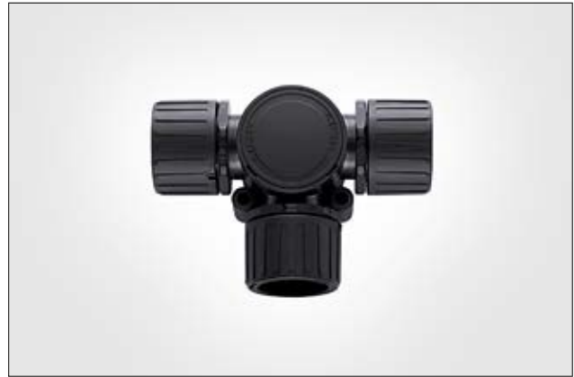
HeliaGuard HG-T, T-Connector, IP66.