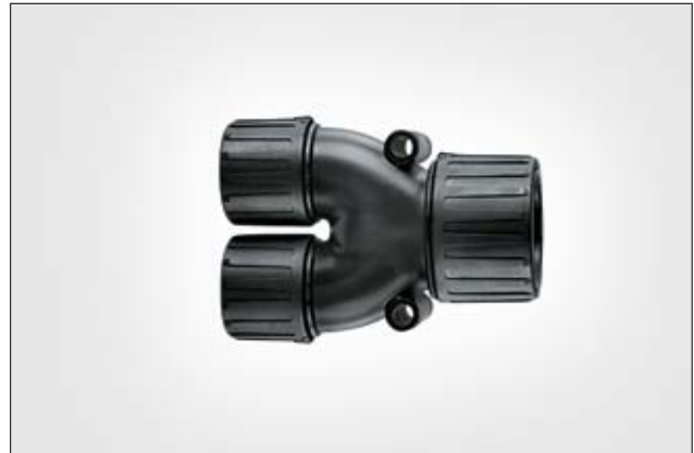
HeliaGuard HG-Y, Y-Connector, IP66.