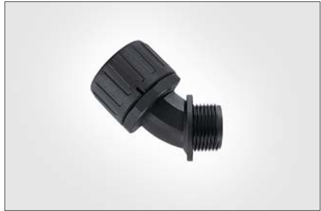
HeliaGuard HG-45 45° Elbow, IP66.