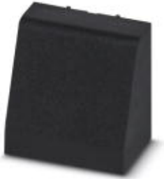
Component housing, color: black, width: 22.5 mm

Please be informed that the data shown in this PDF Document is generated from our Online Catalog. Please find the complete data in the user's documentation. Our General Terms of Use for Downloads are valid ( http://phoenixcontact.com/download )